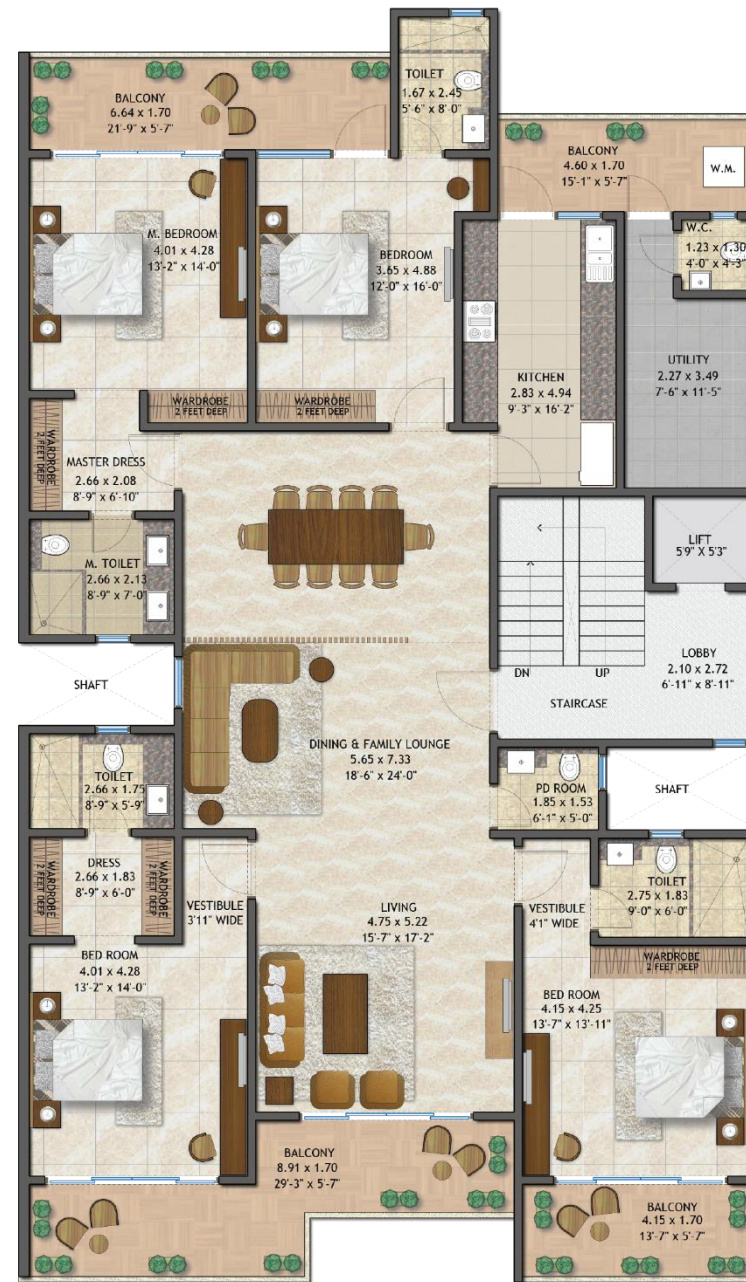
FIRST, SECOND, THIRD & FOURTH FLOOR PLAN