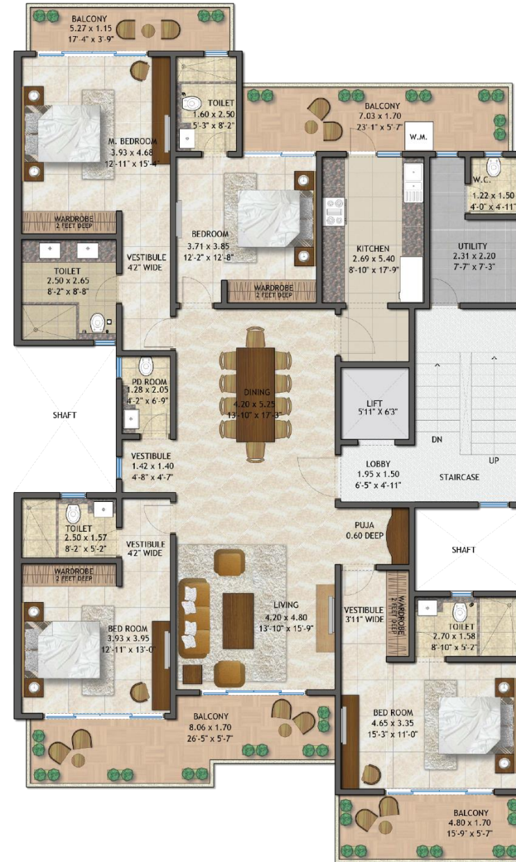
FIRST, SECOND, THIRD & FOURTH FLOOR PLAN