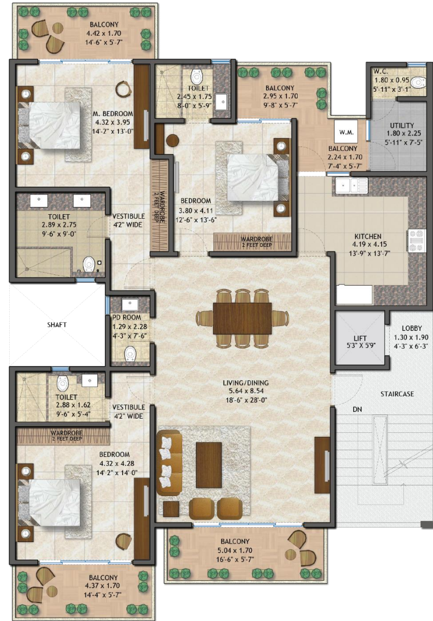
FIRST, SECOND, THIRD & FOURTH FLOOR PLAN FOR