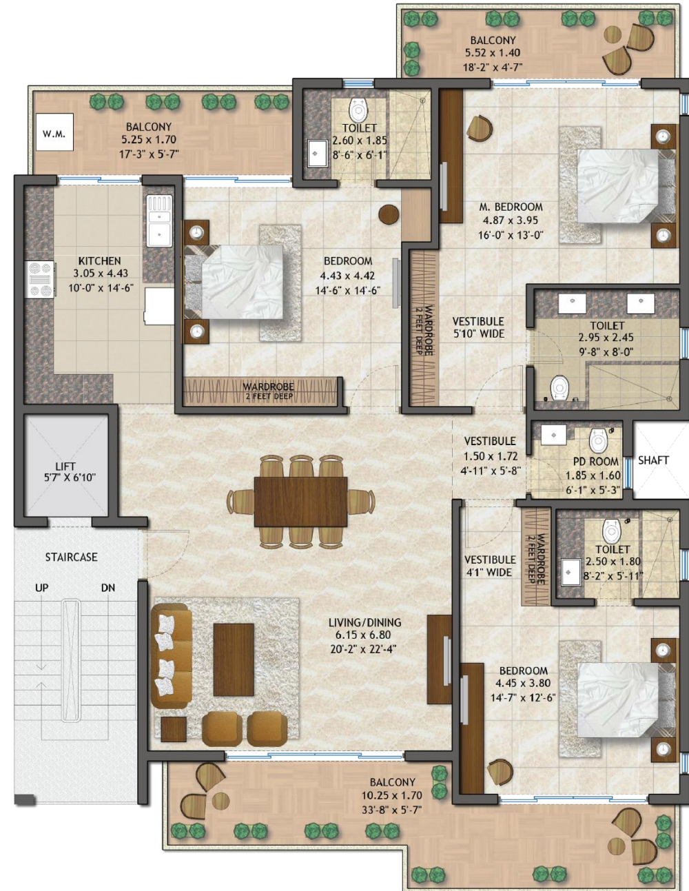
FIRST, SECOND, THIRD & FOURTH FLOOR PLAN